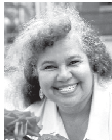
Maria Will Pay

Maria, a 67-year-old widow, earns a moderate income. She is generally healthy and she takes a few medications. She pays about $2,000 per year for her prescription drugs (just over $160 a month). In 2006, Maria would save $928.50 under the standard Medicare prescription drug coverage.