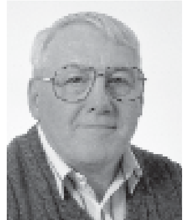
Evan Will Pay

Compare that amount to the $4,850 Evan would have paid without Medicare's prescription drug coverage—he saved $1,116 .